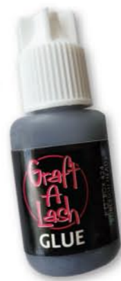
Three-second fast dry glue