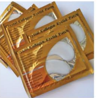
Collagen Eye Pad Collagen is great for reducing dark circles and puffy eyes. Cool and hydrating.