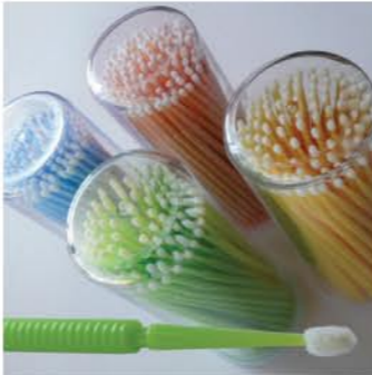
Micro Sticks - for use with glue remover. Random colours available in 50 & 100 packs