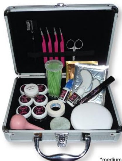
*medium kit shown