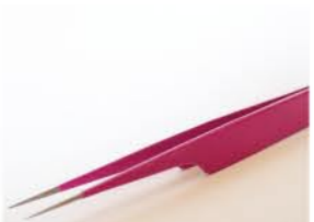
Tweezer D - Straight, light and pink enamel