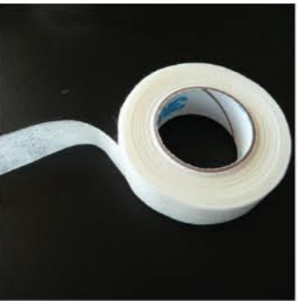
Paper Tape - use to tape over bottom lashes for eyelash grafting procedure.