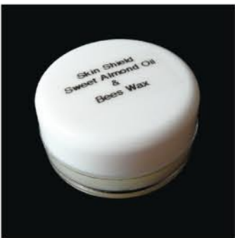
Skin Shield - Petroleum free. Use with eye shields to hold them in place.

Stock your Graft-A-Lash Kit with these great products