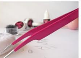
Tweezer A - Curved, light and pink enamel