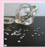
Pot of 50 Crystals

AVAILABLE SEPARATELY TO TOP UP YOUR KIT;