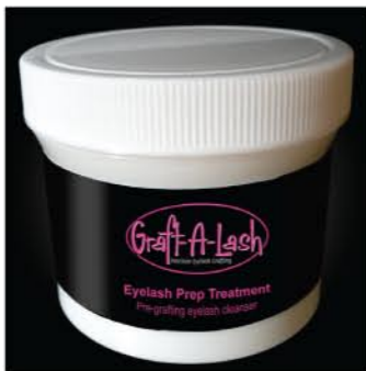
Eyelash Prep Treatment - effectively remove oils and proteins from eyelashes prior to grafting to ensure a lasting result.