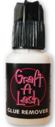
Gel glue remover