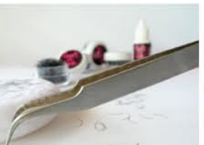
Tweezer C - Curved, stainless