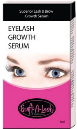
Graft-A-Lash Superior eyelash growth & conditioning serum. Safe to use while wearing lash extensions. Promotes the growth of new healthy natural lashes. Applicator is included. Add on purchase for your Eyelash Grafting clients.