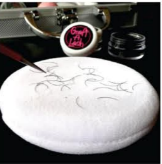
Lash Puff - will hold your lashes securely while you work. Makes picking up lashes easy.