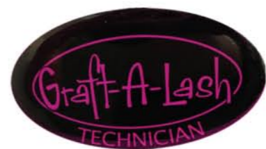
Graft-A-Lash professional technicians badges. Durable and eye-catching resin finish.