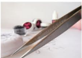
Tweezer B - Straight, stainless