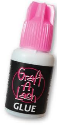
Ten-second dry glue