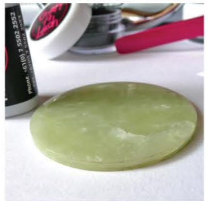
Jade Stone keeps glue from setting while you work