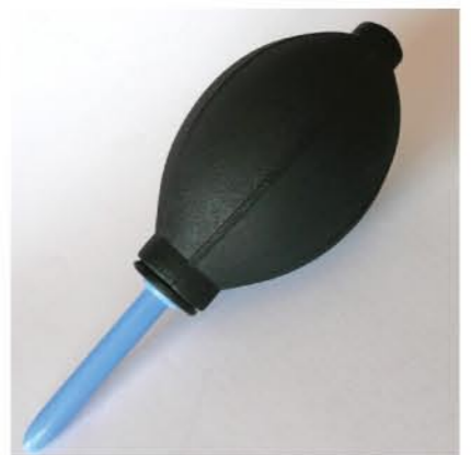
Eyelash Puffer to dry lashes during the grafting process