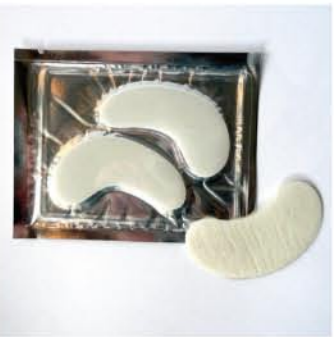
Lint-free Shields Use to protect bottom lashes during grafting. More comfortable for your client and easy to remove.